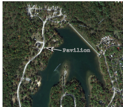
Fig. 2. Pavilion Location