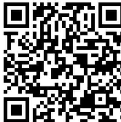
Fig. 4. Follow the East Coast HDT Rally on Facebook, and share your own photos with the rest of the crowd!

Packages/mail are delivered to the campground office/store at the main gate, and can be picked up during business hours. 3609 Peavine Firetower Road Crossville, TN 38571-7958 (877) 337-8678