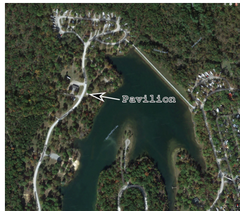
Fig. 2. Tent Location

Paul Gillenwater will be helping with parking. If you'd like help getting to, or getting into your site, let Kim know when you check in at the front desk.