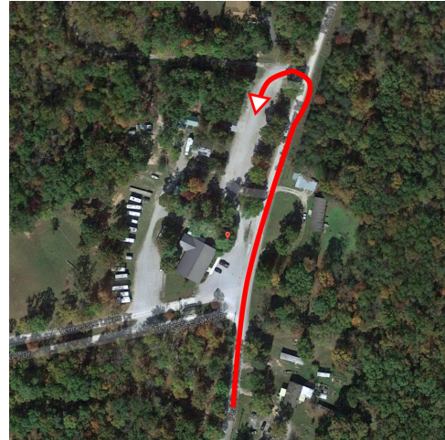
Fig. 1. Check-in Parking

When you approach Deer Run RV Resort on Peavine Firetower Road, drive past the entrance gates and general store, following signs for big rigs. Turn left and double back into the parking area, and head into the general store/office, as shown in figure 1.